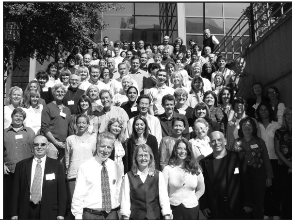
Attendees at a recent QRA™ Seminar in Austin, Texas

This method of assessment is reliable, reproducible, clinically effective, and scientifically valid as it is based on the scientific principles of known facts of human physiology and quantum cellular resonance.