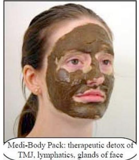
Medi-Body Pack: therapeutic detox of TMJ, lymphatics, glands of face

The mud packs have a similar infra-red affect as the Erchonia laser restoring cellular resonance and coherent electrical frequency balance. They initiate the release of up to 50% of the body's toxins in 1 application. They move deep seated hidden toxic debris in trauma sites from the soft tissues of the body.